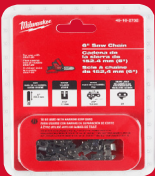
152MM (6") SAW CHAIN 49-16-2732