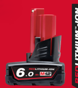
REDLITHIUM-ION BATTERY PACK