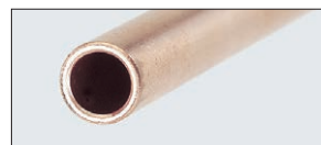
Item no. TA520CR-10

Without burr left inner surface of the tube,ss if it is finished by knife.