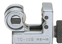
Item no. TA560H