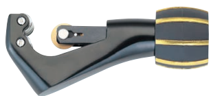
Item no. TA560AG